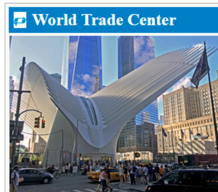
The WTC Transportation Hub in September 2016